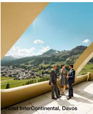
Hotel InterContinental, Davos