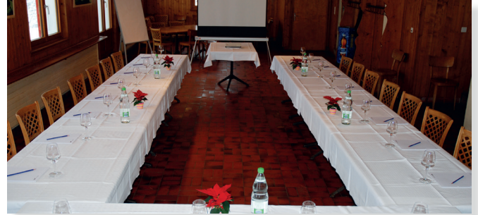
Les Pléiades meeting room - capacity 50 - 80 people CHF 200.-/day