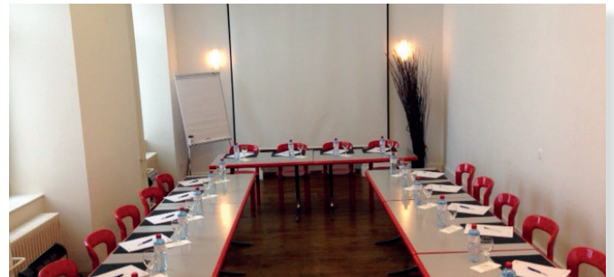
Rochers-de-Naye meeting room - capacity 10 - 30 people CHF 170.-/day