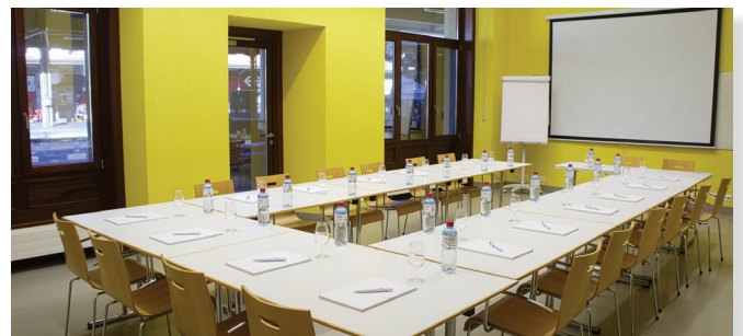
Meeting room at the GoldenPass Center in Montreux - capacity 10 - 40 people CHF 200.-/day