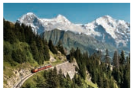
Schynige Platte Railway Wilderswil – Schynige Platte