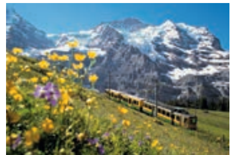
Wengernalp Railway Grindelwald/Lauterbrunnen – Kleine Scheidegg