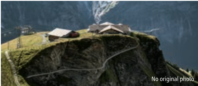
First Cliff Walk