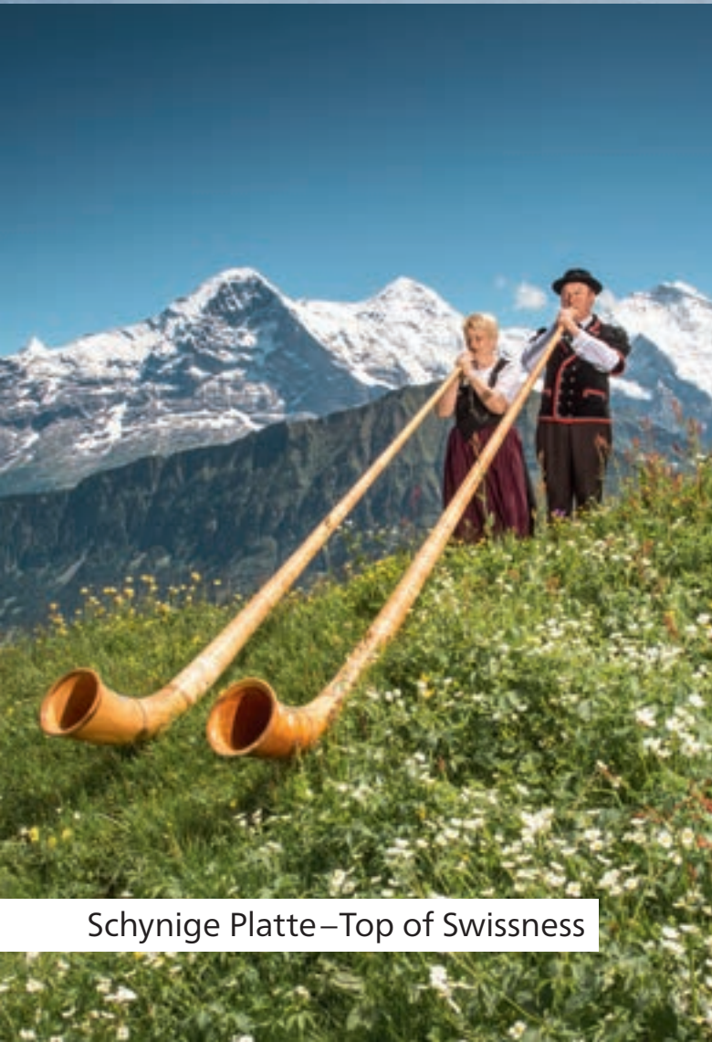
Schynige Platte – Top of Swissness