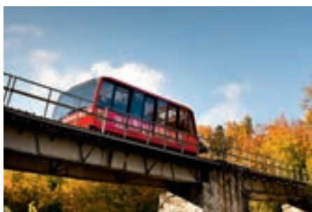
Harder Railway Interlaken – Harder Kulm