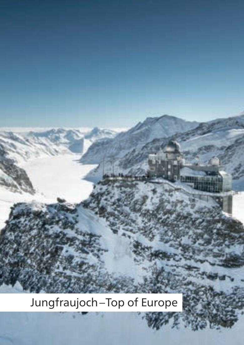
Jungfrauoch – Top of Europe