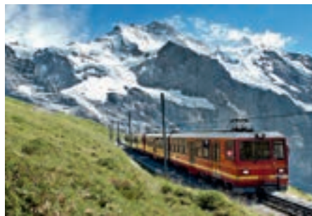
Jungfrau Railway Kleine Scheidegg – Jungfraujoeh – Top of Europe

The trip with the Jungfrau Railway to the Jungfraujoeh–Top of Europe is one of the highlights of every visit to Switzerland.