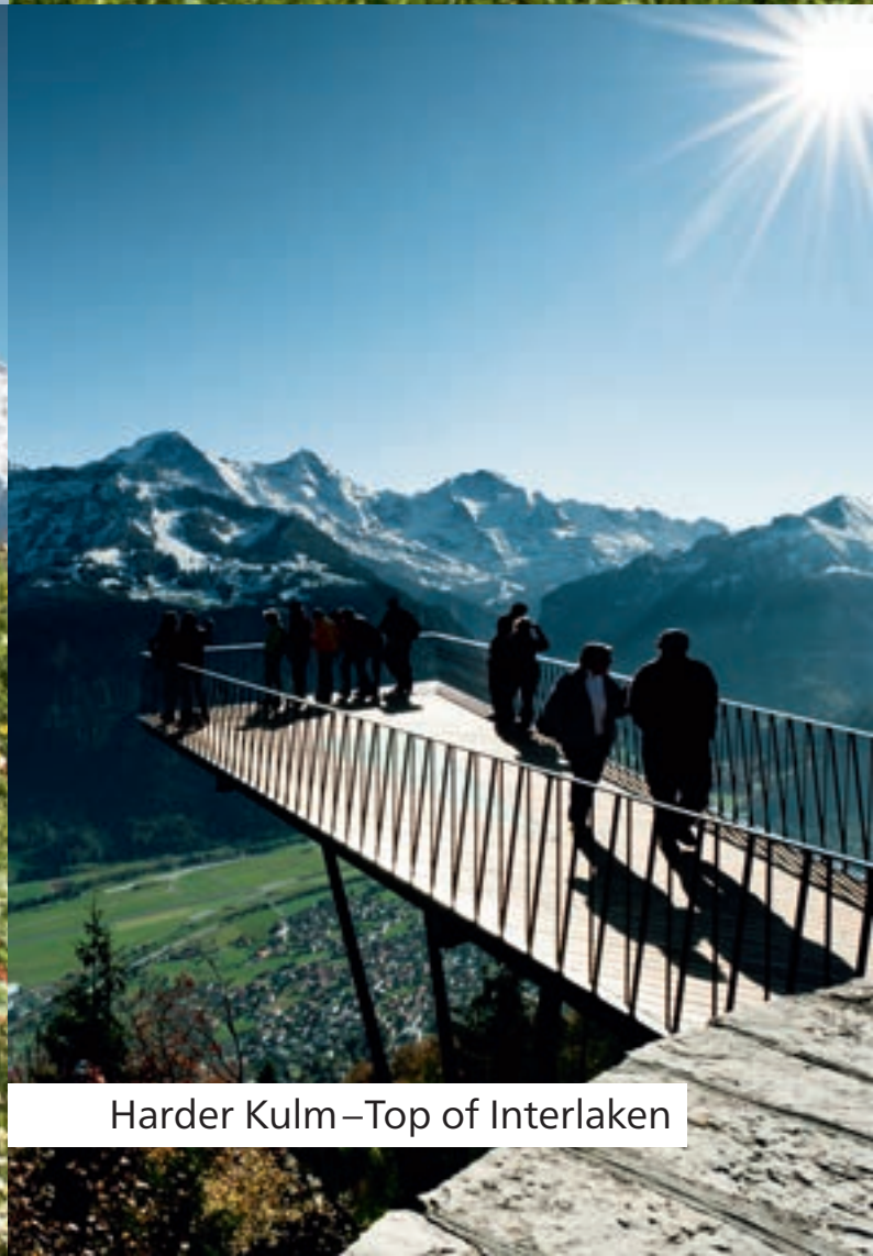
Harder Kulm – Top of Interlaken