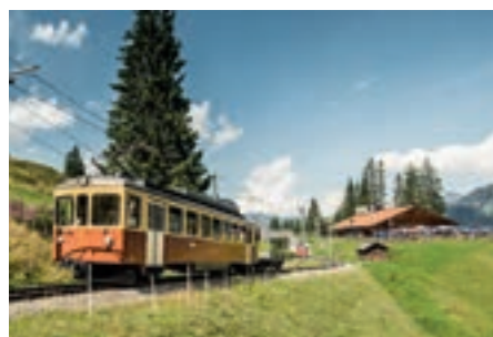
Lauterbrunnen – Murren Rail & Cableway Lauterbrunnen – Murren via Grutschalp