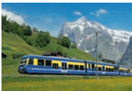
Bernese Oberland Railway Interlaken Ost – Grindelwald/Lauterbrunnen