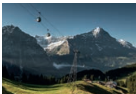
First Aerial Cableway Grindelwald – First