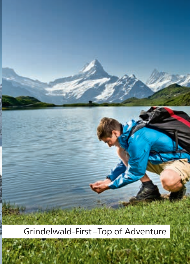
Grindelwald-First – Top of Adventure