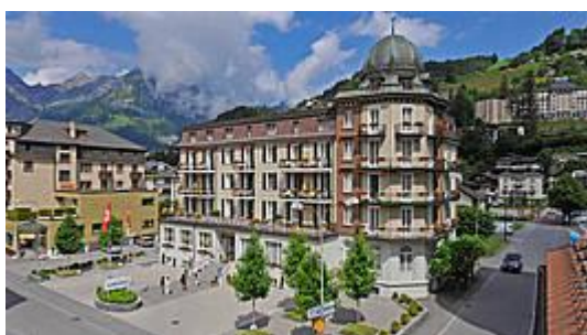
HOTEL SCHWEIZERHOF ***

Seminar rooms: 4 Max. participants: 150 Beds: 37 Rooms: 20