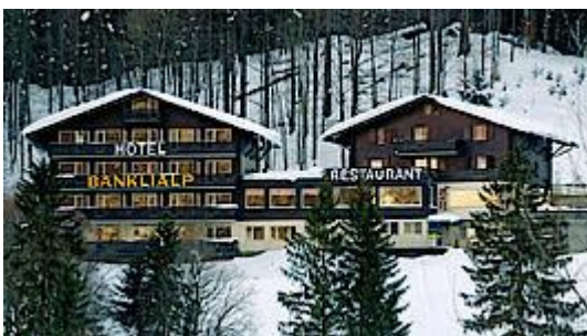
HOTEL BÄNKLIALP ***

Seminar rooms: 4 Max. participants: 120 Beds: 116 Rooms: 58