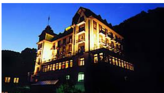
HOTEL EDELWEISS ***

Seminar rooms: 3 Max. participants: 150 Beds: 80 Rooms: 43