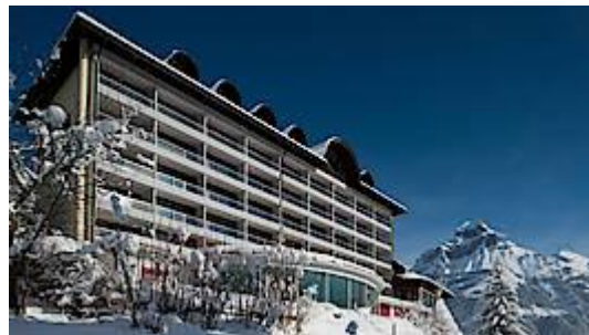
HOTEL WALDEGG ****

Seminar rooms: 7 Max. participants: 190 Beds: 256 Rooms: 128