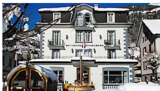
SKI LODGE ENGELBERG

Seminar rooms: 3 Max. participants: 40 Beds: 72 Rooms: 38