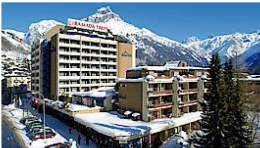
RAMADA HOTEL REGINA TITLIS ****

Seminar rooms: 7 Max. participants: 190 Beds: 256 Rooms: 128