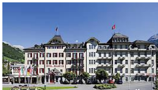
HOTEL BELLEVUE-TERMINUS ****+

Seminar rooms: 2 Max. participants: 80 Beds: 59 Rooms: 30