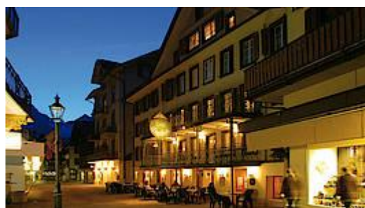
HOTEL ENGELBERG ***

Seminar rooms: 3 Max. participants: 150 Beds: 80 Rooms: 43